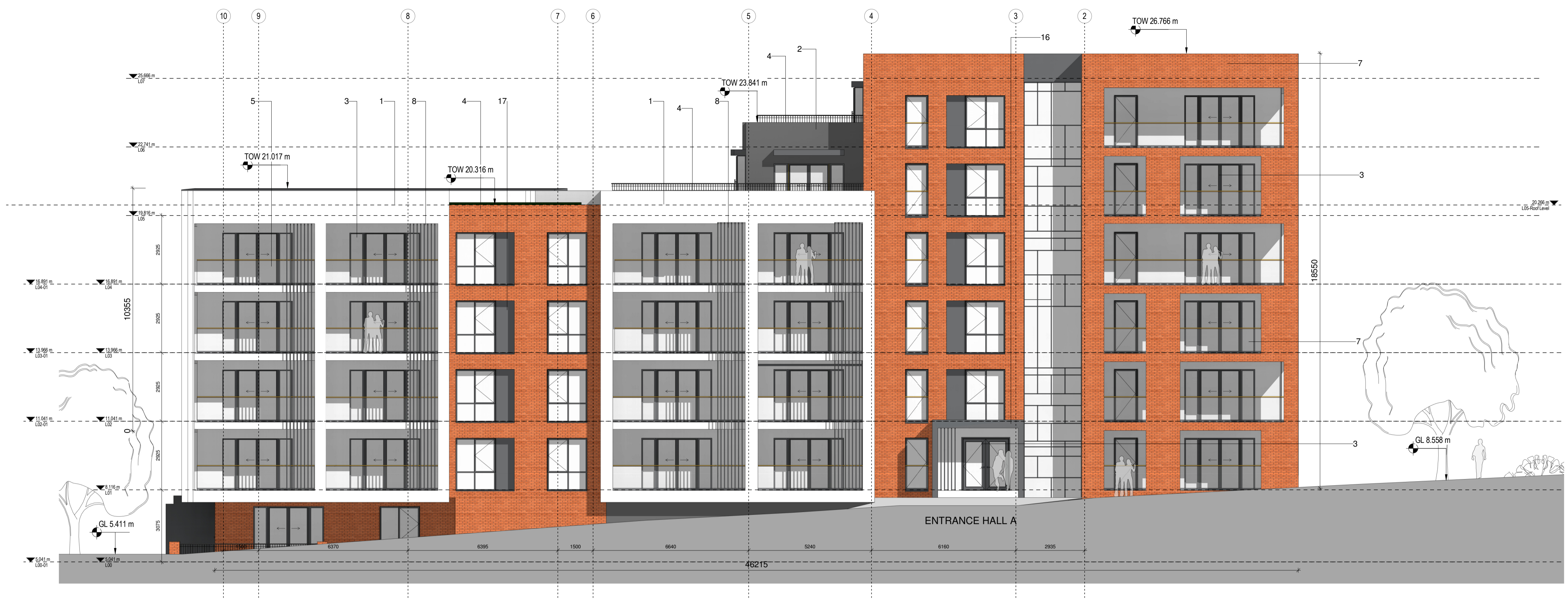
1 ELEVATION.A 1 : 100 @A1